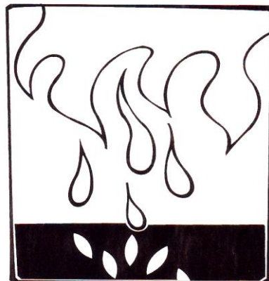
SEASON AFTER PENTECOST